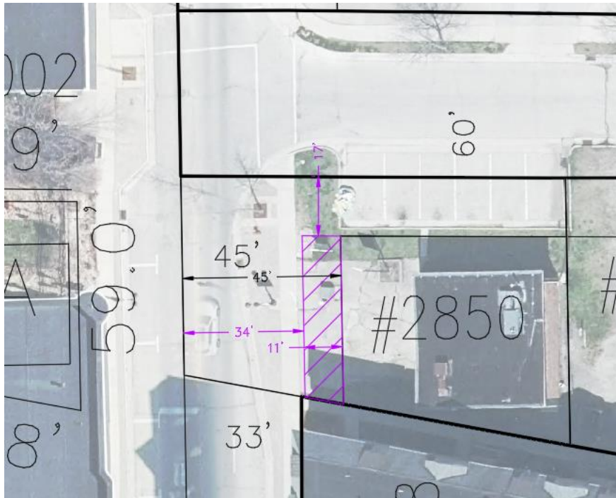
Figure 1 - the violet color cross- hatch represents the 11 feet of discontinuance on this plat map figure

Being the discontinuance of that part of the easterly 11 feet of North Brookfield Road, being the easterly 11 feet of the westerly 12 feet, excepting the northerly 17 feet thereof of Lot 1, Block 1 of Hoffman's Assessment Plat number 5, being a subdivision in the Waukesha County Register of Deeds recorded as document number 233858 on June 21, 1940, being that part of lands previously acquired by document number 675578, being that part of the Northwest 1/4 of Section 16, Township 7 North, Range 20 East, in the City of Brookfield, Waukesha County, Wisconsin.