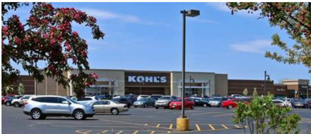
Kohl's at Elmbrook Plaza Shopping Center