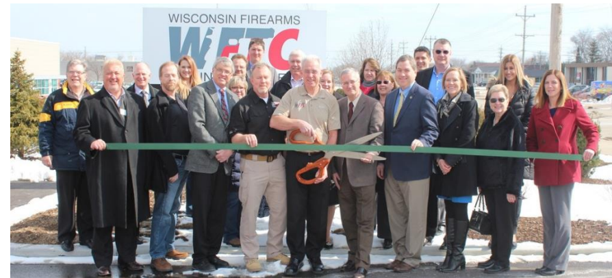
Wisconsin Firearms Training Center