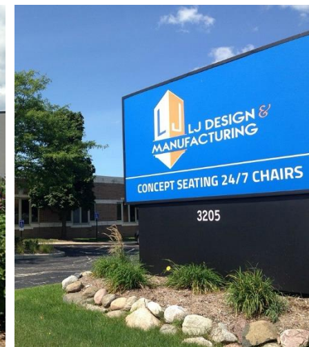
LJ Design & Manufacturing