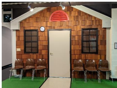
Survive Alive Classroom