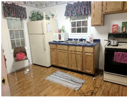
Survive Alive Kitchen