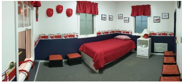
Survive Alive Bedroom