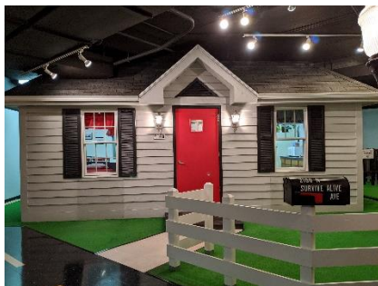
Survive Alive House

We are very grateful to all of those throughout the years who have supported and contributed time or resources to help our Survive Alive program. This past year, due to COVID-19 restrictions, all in-person Survive Alive programming has been temporarily put on hold. However, virtual fire and life safety lessons are still being shared with students and teachers. Unfortunately, there will be no in-person 25 th anniversary celebration scheduled due to COVID. Check out our Community Risk Reduction and Public Education link for more information.