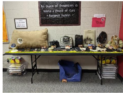
Survive Alive "Museum"